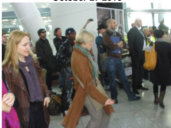
A "passenger" bursts into song and dance!

What a fantastic, joyful experience to be part of the, now fairly famous, T-mobile flash-mob advert at Terminal 5 on October 27 th . I was flying to Copenhagen to teach VRT but heard the sound of a beautiful lone voice as I entered the terminal concourse at 10.30 a.m. so, instead of heading to Departures, I went to see what was going on at Arrivals. I immediately became aware that many of the hundreds of "passengers" were singing a cappella songs. An incredible feat for unaccompanied voices. There were also no instruments, just every voice making the sounds of drums, violins, trumpets etc. As the superb medley of musical excerpts got underway, I realised that I had got caught up in something very special that was contagious and uplifting to even the most experienced or jaded traveller!